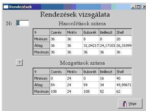
Figure 11. An output of a program characterizing sorting empirically.

formula depending on N was entered here, and here appears our predicted value belonging to a given N . Whereas the third part of the table shows the difference between the previous two coherent values. (See Figure 12.) Our idea on how to use the spreadsheet is to vary the formulas in the middle part of the table until – according to our expectations – the part of the table of difference contains only 0 values.