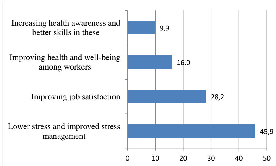
Figure 2. What do you think is the end result of workplace health promotion? (n=157) in percent (%)