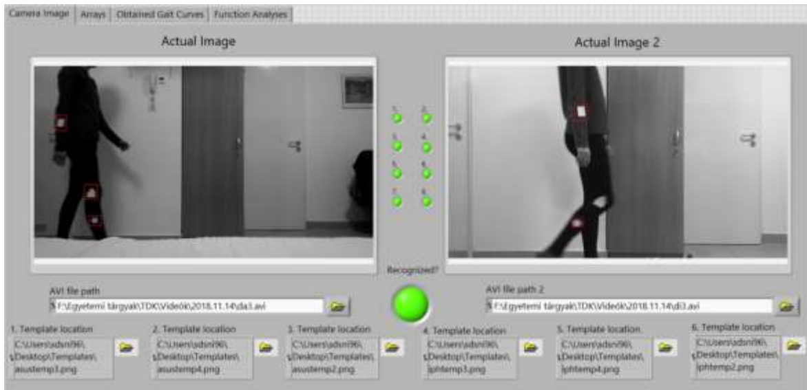
Fig. 1. The First Tab of the Front Panel of Gait Recognition Software.