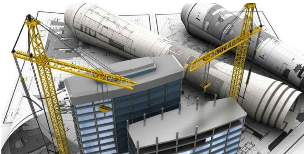
Fig. 3. BIM simulates construction methodology, sequencing and finances in a near perfect reflection of reality

BIM also known as "parametric" modelling is a powerful computer-based system which allows architects, engineers and other experts of the field to create, visualize, test and continually modify digital models for the buildings. BIM should not be seen as limited only to the buildings, it can be applied in developing new plans for communities, industrial parks, urban revitalization for entire cities, etc. Despite the ability to register and offer detailed data for all the systems like heating, electricity, etc. within the buildings BIM also makes possible 3D presentation and visualization of the buildings and all this accompanied with the possibility for simulation and computations through the planning process (Borrmann 2010). As other GI systems are appropriate in visualization of