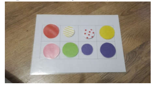
Figure 2. Balls in line (By the Authors)

The tools: 8 different coloured and patterned balls, the board with Velcro