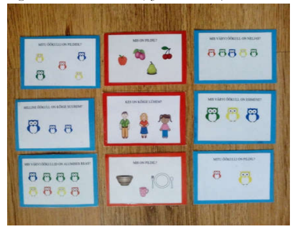
Figure 8. Owls extra cards(By the Authors)

All pieces are placed on the 'start' area of the board. The first player is determined by draw. The player takes steps according to the roll of the dice. When the player ends up on the red or on the blue field, a function card is drown, it is read out loud and the question needs to be answered. If the answer is right, the player gets to stay on the same place, if the answer is wrong the player needs to take one step back.