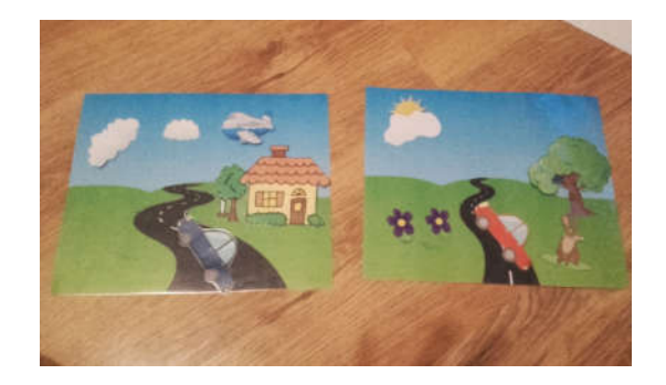
Figure 6: The wide and the narrow road (By the Authors)

Tools : Boards, different objects to be placed (flowers, plane, house, tree, cars etc.)