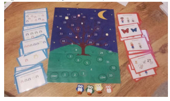
Figure 7. Owls (By the Authors)

Tools: The board (tree with owls), blue and red function cards, game pieces (4 owls), dice.