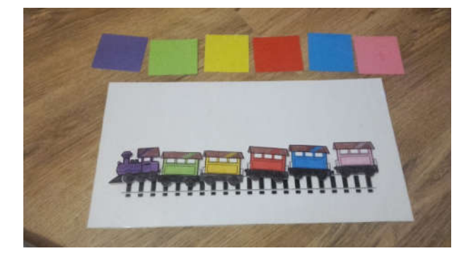
Figure 1. The Train (By the Authors)

A strip of velcro is fixed on the base board with rails - the player uses the velcro to attach wagons to it as guided by the teacher (Figure 1). The wagons are lined up after each other however the child needs to rearrange them as instructed. This develops attention, thinking and fine motor skills. The child needs to understand that in order to place a wagon they need to rearrange the ones already in place.