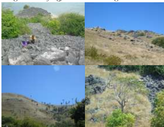
Figure 2: Morfology condition in Luang Island

Luang Island is composed of two villages Luang Barat and Luang Timur both of which are situated along the coastal strip of the island. Beyond these primary settlement areas, the Luang community holds customary territorial rights ( petuanan ) over several surrounding small islands, including Liakra, Kapoeri, Tiaata, Nowlauna, Po'u Romkihiera, Watuwelada, Upasrui, Metutun, Metiamarang, Wekenau, and Tamta/Kalapa. Collectively, these territories form an interconnected ecological and social unit that constitutes an integral component of the local knowledge system and customary institutional framework of the Luang people (Kissiya & Biczó, 2024).