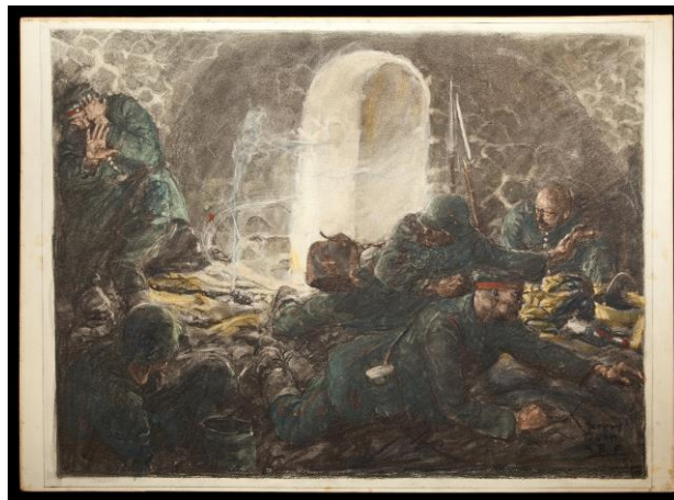
Figure 11. Harvey Thomas Dunn, The Hand Grenade, ca. 1918

Grenade”). In contrast to the American soldier in Street Fighting who bravely makes a stand in street cluttered with debris, Dunn portrays the German soldiers as cravenly hiding in a bunker.