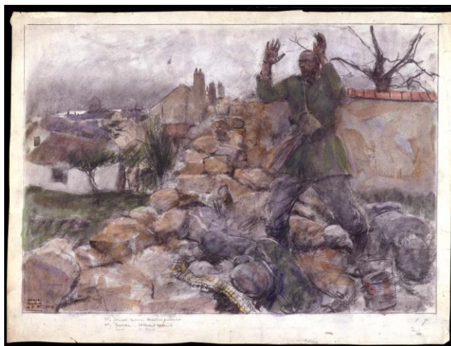
Figure 9. Harvey Thomas Dunn, Machine Gunners at Pomme-St. Mihiel Salient , 1918