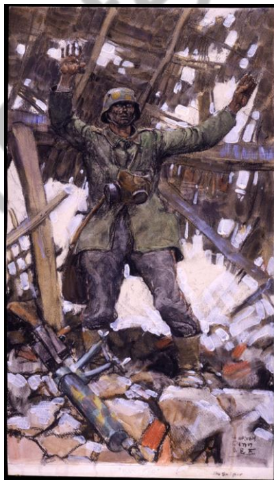
Figure 7. Harvey Thomas Dunn, The Sniper, ca. 1918

Such accounts attest to Dunn’s bravery (or bravado) and, when interpreted in light of the visual similarities between Dunn and the soldiers he represented, the degree to which he identified himself with his own ideal of the heroic soldier male becomes clear. The specifically American character of these masculine military men is obvious when one compares them to Dunn’s wartime images of German soldiers. For instance, in contrast to the steely-eyed American in The Machine Gunner , the look of fear on the surrendering German soldier’s face in The Sniper (ca. 1918) belies the weakness underlying his superficial brawn. The wide-eyed soldier, whose gas mask dangles around his midsection, stands unsteadily atop a pile of rubble and raises his arms in surrender.