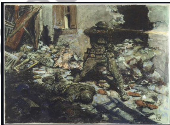
Figure 10. Harvey Thomas Dunn, Street Fighting, ca. 1918

continues to fire his weapon despite what appears to be a dire situation. The soldier stands next to the debris of a ruined building and fires his M1903 Springfield rifle at an unseen enemy (“Street Fighting”). A yellow blast emanates from the barrel and extends beyond the frame. An apparently dead soldier lies face-down on the ground by the standing soldier’s feet. The standing soldier’s face is obscured but his actions and his firmly planted stance seem to indicate that he is unafraid. Rather than surrendering like the German soldier or attempting to flee or hide, the American doughboy bravely faces his opponent and continues the fight for which his compatriot gave his life. The line of the dead soldier’s leg leads the viewer’s eye directly to pieces of debris with red and white stripes and traces of blue. This rubble is piled behind the standing soldier. The colors of this debris evoke the American flag and make the faceless soldier and his courage under fire emblematic of the valor of the American military in general. This subtle evocation of the American flag also affirms the rhetoric of the heroic sacrifice of the fallen warrior who died fighting for the noble ideals of peace, justice, and freedom.