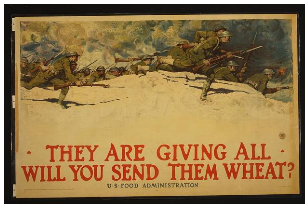
Figure 3. Harvey Thomas Dunn, They Are Giving All—Will You Send Them Wheat? 1918