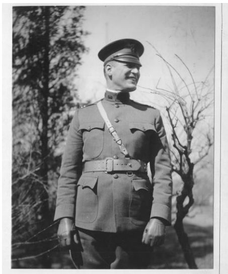
Figure 6. Photograph of Captain Harvey Dunn, ca. 1917