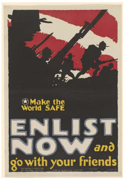
Figure 1. Arthur N. Edrop, Make the World Safe Enlist Now and Go with Your Friends , 1917