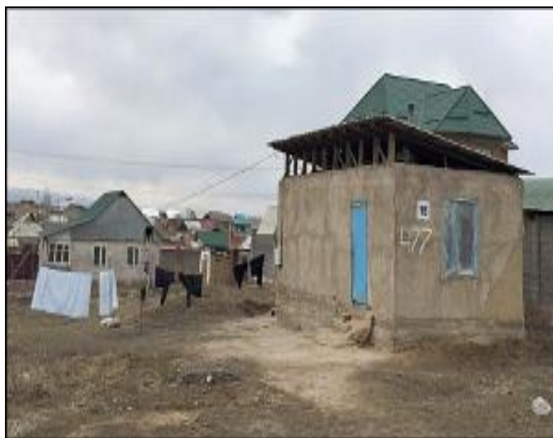
Pic. Nr. 3. Ak-Ordo New Settlement . Voldykov 2020a.