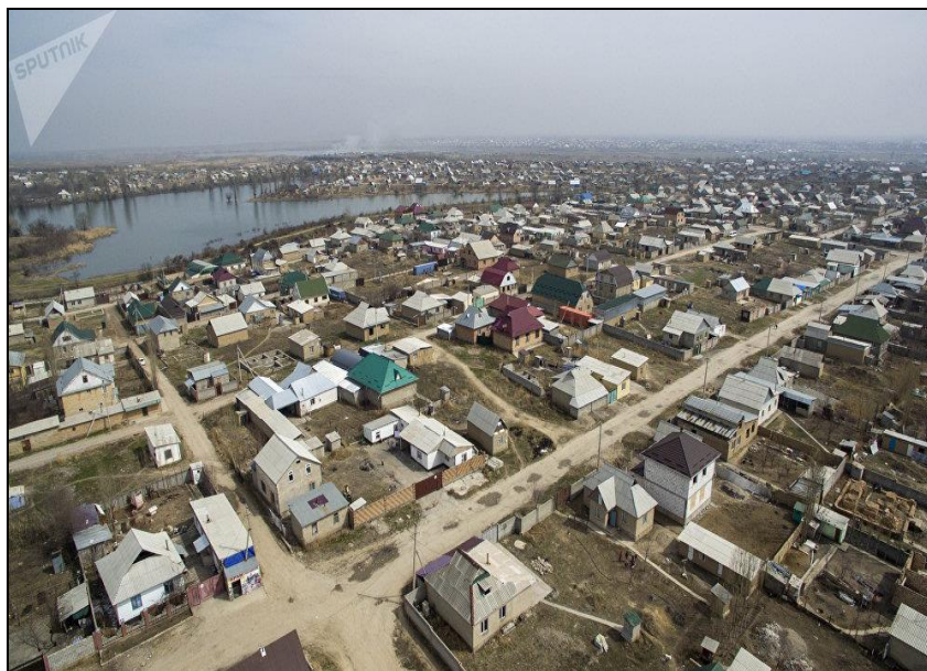
Pic. Nr. 1. Bakai-Ata New Settlement.

Moreover, internal migrants, many of whom do not have a permanent job or are employed without a contract, will not have ample opportunity to benefit from the results of this program. Among the surveyed residents of new settlements, most of the respondents noted that members of their families of working age are employed in the private sector (services, trade, production).