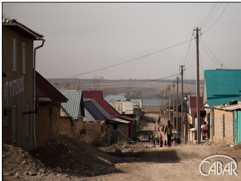
Pic. Nr. 2. Muras-Ordo New Settlement . Voldykov 2020a.