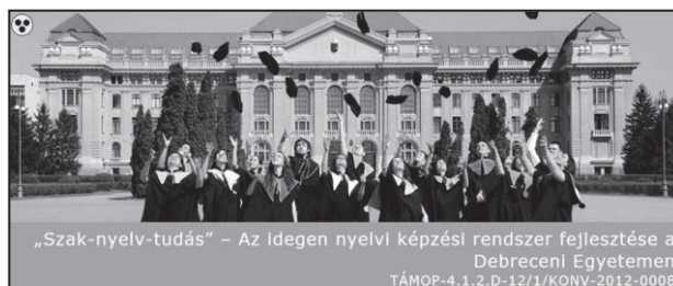
Figure 2. The opening page of the project ( http://szaknyelvtudas.unideb.hu )

The present foreign language training project at the University of Debrecen intends to meet the needs of the labour market. “Szaknyelv-tudás” – Az idegen nyelvi képzési rendszer fejlesztése a Debreceni Egyetemen (TÁMOP 4.1.2.D-12/1/KONV-2012-0008. “Technical language skills” – Improving foreign language training programs at the University of Debrecen) ( http://szaknyelvtudas.unideb.hu ).