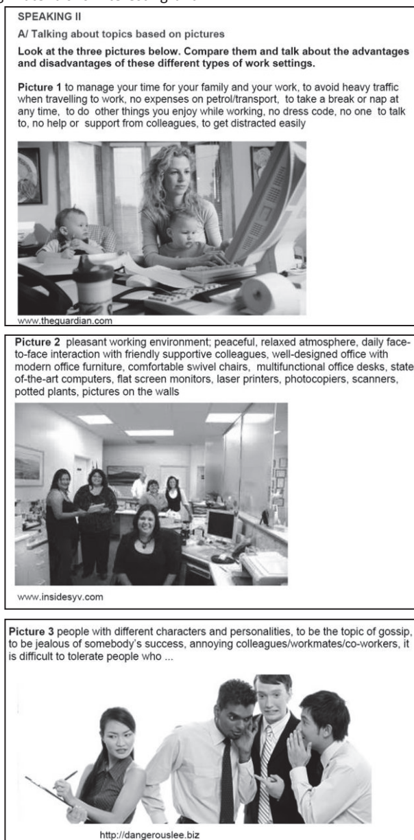
Figure 5. Pictures from the oral curriculum

inspiring for the language learner and an excellent opportunity for improving language skills and getting familiar with most recent resources.