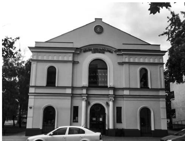
Figure 1. Building of the Bekesi Szilvapalinka Centrum.

Arpad Palinka Tanya: A distilling plant in the northern part of Bekescsaba, operating for more than 10 years. Young entrepreneurs safeguard its expansion in terms of product range and services based on their knowledge and experience learnt from their fathers in the framework of the newly established Kisret Manufactory Ltd. It includes a tasting and exhibition facility with a seating capacity of 24 where they can showcase their own premium palinka products and touristic program packages.