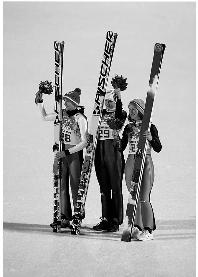
2. Picture. The announcement of results in 2014

I used semi-structured deep interviews (N=37) with the women athletes of Hungarian biathlon, figure skating, ice hockey and Nordic skiing sports. I collected data from university students also, with the help of a questionnaire