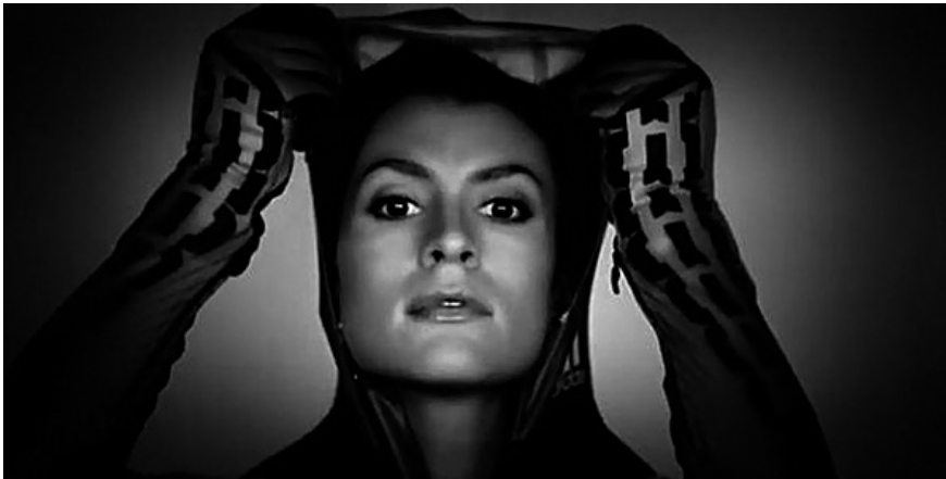
1. Picture: Female athlete in skeleton

Grenoble Balázs Éva was the 24th and 27th in Nordic ski events. In the 70's the Hungarian ski sport was stagnated, but the biathlon started as a new sport. The number of the participants weren't more; the appearance of the new sport just shared the number of the athletes. The Nordic skiers started immediately the biathlon and this phenomenon resulted that the importance of the Nordic skiing just decreased automatically in Hungary.