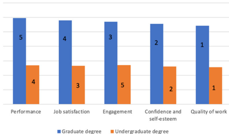
Figure 2: Affect of your motivation on the different descriptions (n=103)

motivation will have a strongly affect on their engagement (5) and performance (4). On average, the motivation of the employees will significantly affect (4) all the above statements ( Figure 2 ).