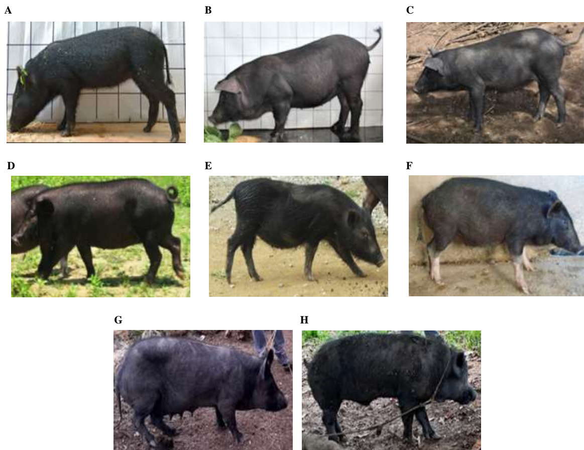
Figure 5. Philippine native pigs A: Benguet native pig, B: Q-Black, C: Markaduke, D: BT Black, E: BT Kalinga, F: Yookah, G and H: Bukidnon native pigs

These strains include (Benguet native pig (BNP), Q-Black, Markaduke, Bai Tiaong (BT) black and Bai Tiaong Kalinga, Yookah, Sinirangan and ISUbela) (The Pork Production Committee, 2004; Icamina, 2019; P.C.A.A.R.R.D.-D.O.S.T). There are various preparations for its meat, but the most popular is roasting it whole ( Lechon ). There is a steady increase in this product's demand as its meat is healthier than exotic breeds' meat, based on its higher crude protein and ash content and lower calorie levels from fat and