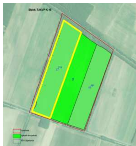
Figure 1. Experimental site

Our field experiments were carried out in Training Farm of University of Nyíregyháza. The 250 hectare field located in Nyírtelek-Ferenctanya, where ecological farming (lacy phacelia, mustard, sunroot, lupin) is managed in 138 hectares, besides conventional crop growing. In 2018 our experimental site took place in nearly 12 hectare (Figure 1).