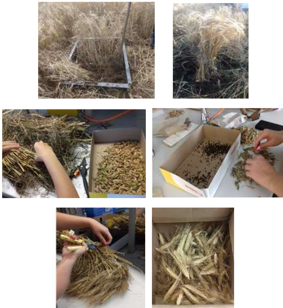
Figure 2. Digging out, bounding and processing of plant samples

Soil was prepared for sowing in September. Shallow ploughing was followed by seedbed combination. Mixed cropping and strip cropping was applied. In mixed cropping 30 kg hairy vetch seed and 70 kg triticale seed was applied per hectare in the end of September. In order to avoid the seed segregation hopper of sowing-machine was filled with 100 kg mixed seed. Triticale and vetch were sown in different rows. Ratio of triticale and vetch rows was 6:2 both in strip cropping and in mixed-cropping. Since our experiment was carried out in an ecological farm, no fertilizer or pesticides were applied. Plots were harvested in 1 st July 2019. The 1 m 2 size plots were set up in four repetitions. Plants at early ripen stage were dig out, bound and roots were washed. Dried plant samples were processed in Plant Growing Lab of University of Nyíregyháza. The above-ground biomass yields and grain yields were measured (Figure 2). Statistic evaluation was carried out by SPSS software.