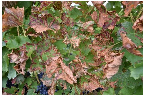
Figure 2: Foliar symptoms on red grape cultivar

In the summer of 2019 a survey was carried out in the Carpathian-basin (Figure 3), in 7 wine regions involving nearly 20000 vines. Our aims were to get data about the susceptibility of cultivars and about the occurrence of the symptoms in the vineyards with different age.