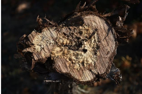
Figure 1: Necrosis and white rot on the cross-section of a decaying trunk

The foliar symptoms are very specific. The toxins produced by the pathogens in the trunk translocate to the leaves. This will cause color gradient interveinal striping, vernacularly the „tiger strip” (Haviland et al., 2019) (Figure 2).