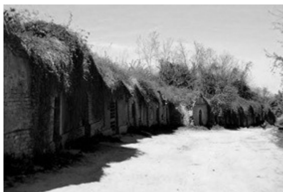
Figure 1: Szalacsi winecellars in Érmellék

running towards the Great Hungarian Plain. River Szamos, Tisza and Kraszna played an important role in the formation of Érmellék. When the weather was dry, the wind left loess and dust coating from silt. In the boggy, swampy areas rich flora and fauna evolved, while in higher areas, woods and lawns were forming. Where Kraszna also leaves the valley, there is Ér, the little brook from Szekeres forest. Érmellék has extremely picturesque architectural wine cellar rows, of which "szalacsi" wine cellar row (wine cellar row system) with its unique structure consists of about a thousand cellars (figure 1).