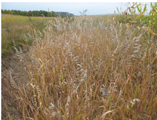
Figure 3: Woolly cupgrass inflorescence branch (A), infesting the edge of a corn field (B/)