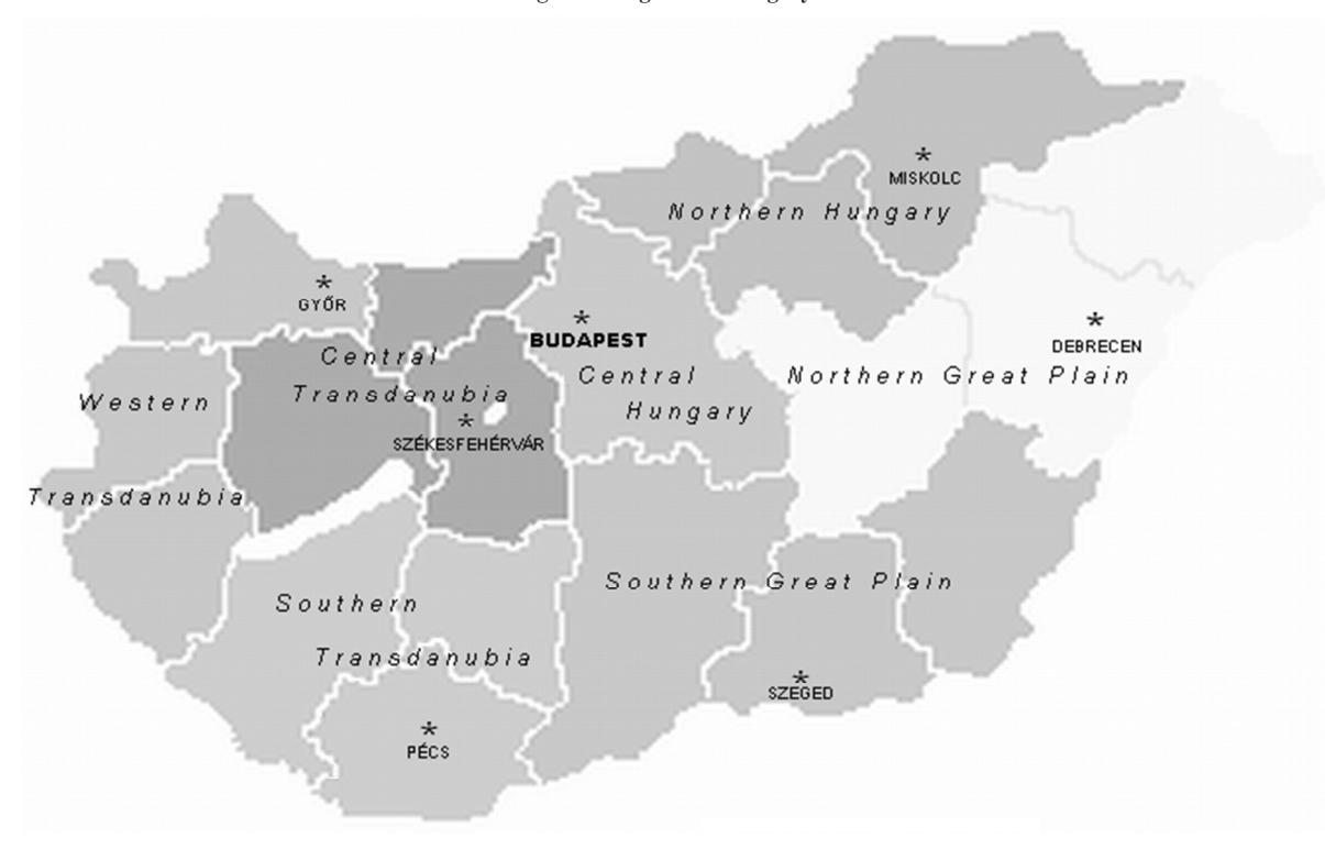
Figure 1: Regions in Hungary