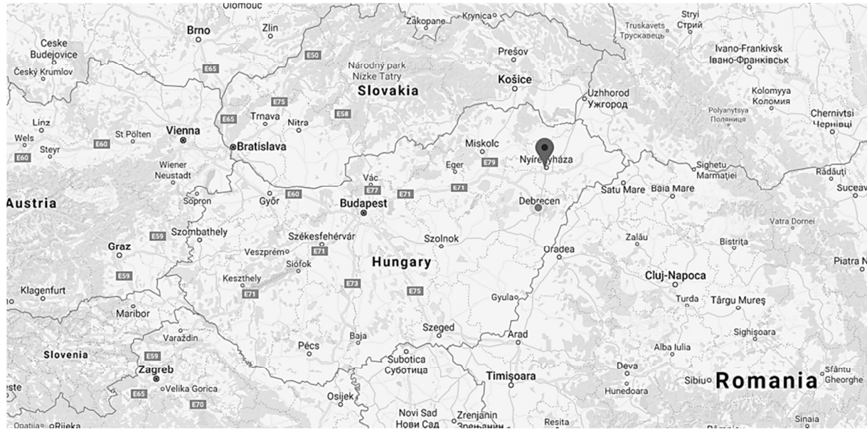
Figure 1: Map of the sampling site

measurements were also recorded, such as weight, wing length, 3 rd quill-feather, and tail length. These records were compared with previous researches, to confirm our predictions that the nesting population's parameters hasn't changed in the last 30 years at the sampling site ( Figure 1 ).