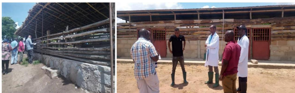
Figure 5. Example of a semi-intensive pig production system

access to veterinary services, and water ( Figure 5 ). The pigs are periodically allowed to wallow, graze, and exercise in a larger area (Moreki et al., 2011).