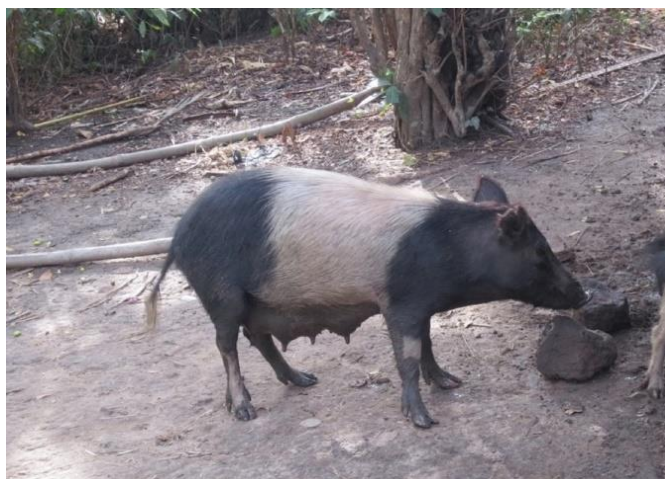
Figure 2. Local sow

alleles found in the pigs suggest they originated from the Middle East through trades across the Indian Ocean (Ramírez et al., 2009). Local pigs have different names in every country where they exist, but they all share a common phenotype (Alenyorege et al., 2015). They are greatly appreciated by rural farmers for their hardiness and disease resistance (Agbokounou et al., 2016). However, they have low reproductive performance and low body weight, weighing 19.2 kg at 180 days old (Darfour-Oduro et al., 2009), 51 kg at 365 days old (Abdul-Rahman et al., 2016), and more than 51 kg above 365 days old (Karnuah et al., 2018).