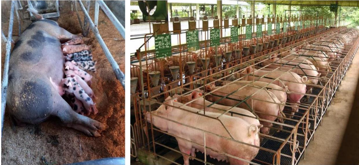
Figure 6. Example of an intensive pig production system

(Lekule et al., 2003). In the urban part of African countries where land is a limited resource, farmers employ the use of this system (Nwanta et al., 2011).