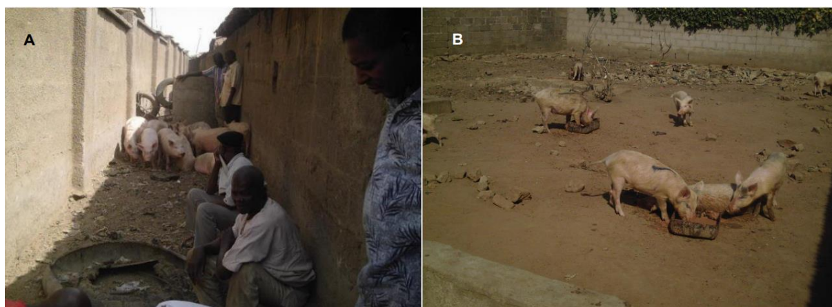
Figure 4. Examples of free-range production systems

This type of system is mostly done in rural areas and is the oldest and most traditional way of raising pigs. It is usually practiced when there is a lack of resources (feed and capital) but abundant land for the roaming animal. Few pigs are kept in this system (1 to 3) and the pigs are left to find their food by scavenging, with food being provided occasionally in the form of kitchen waste or farm byproducts ( Figure 4 ). There is little to no investment in feed, shelter, and access to veterinary care in this system (Kagira et al., 2010). Since the pigs roam about without restriction, there is indiscriminate mating and high inbreeding, leading to poor offspring. Local pigs are more adapted to this system since they are hardy, disease-resistant, and can survive with low-quality feed (Afrill, 2016).