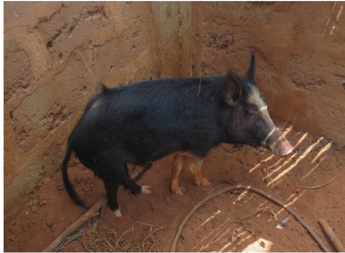
Figure 3. Local boar