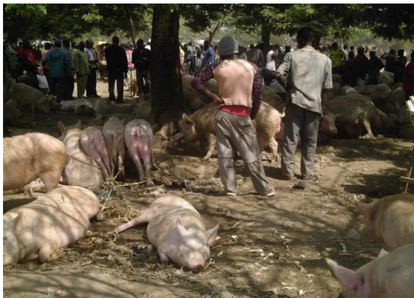
Figure 7. Live animal market

2015). The farmers lack access to high-value markets, making the sales of pigs exploitative and less profitable (Halimani et al., 2020). Only large commercial pig farms have access to the high-value market, such as supermarkets and companies, usually supplying them with pork (Atherstone et al., 2019). Also, smallholder farmers consider pigs to be single-product animals, unlike cattle, sheep, and goats, because pigs have no byproducts (Halimani et al., 2020).