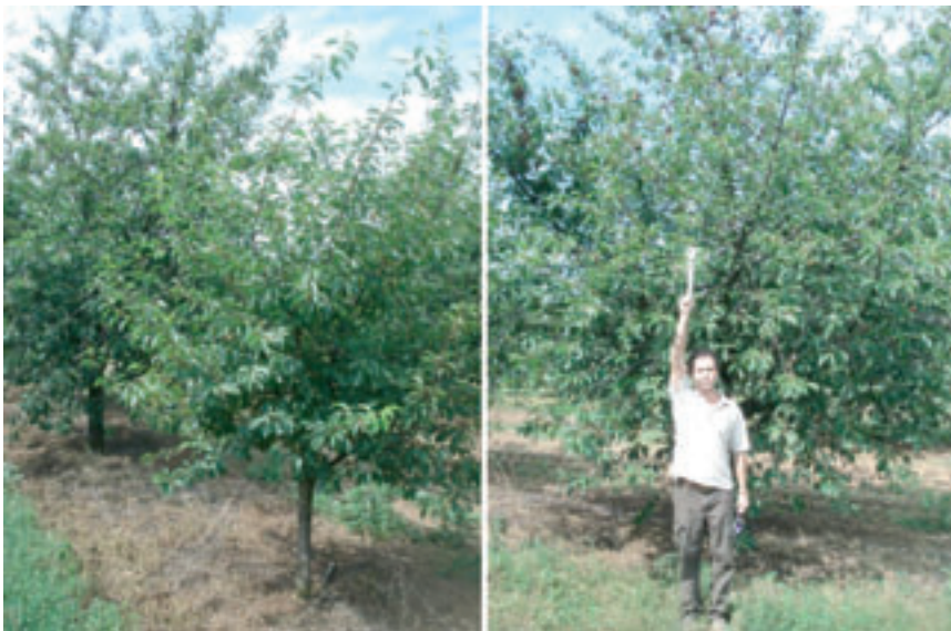
Photo 1 and 2. Damaged cv. 'Kántorjánosi 3' (left) and damaged cv. 'Újfehértói fürtös' (right) (Újfehértó, June 2011.)