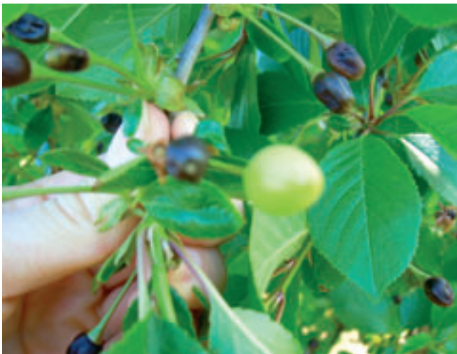
Photo 3. Fruit sets of damaged cv.'Újfehértói fürtös' (May 2011.Újfehértó)