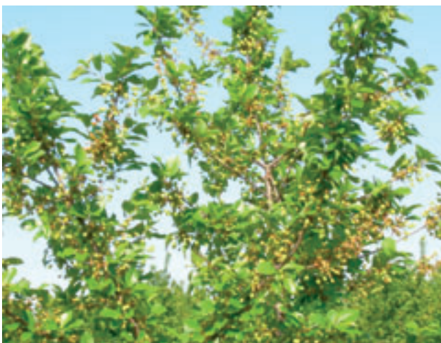
Photo 4. Fruit sets of not damaged cv.'Újfehértói fürtös' (May 2011. Újfehértó)

Air temperature data at the time of the frost event were presented in Table 1. From the data of Table 1 it was evident that at dawn of 6 May significantly and suddenly decreased the air temperature. The low humidity content of air (mean vapour content of air was 47%) and the low motion of air (1,94 m/s) strengthened the degree of frost.