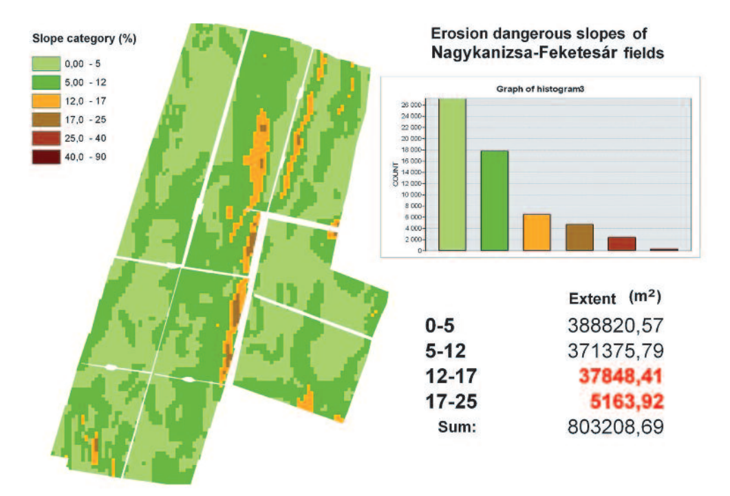
Figure 3: The slope categories of parcels at Nagykanizsa

The highest deficiency of these models is to the fact that these show the altitude of soil surface only and do not demonstrate landmarks on the surface, so the calculation of the direct radiation value results data relating to soil surface. Consequently, we have to give attention to the landmarks for the agro-ecology examination such as solar radiation calculation. After creation of the terrain model by complicated mathematical operations, which contains the fruit trees, and artificial objects also, we could operate solar radiation toolset. These tools are useful to measure the amount of solar radiation in watt hours per square meter on a specified area or a point location. There are several configuration variables to define the time period of the examination, from one point of time to one year period. The potential evapotranspiration could be estimated with adequate precision from the derived maps.