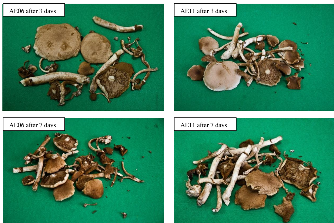
Figure 4. Fruiting bodies of strains AE06 and AE11 obtained from substrate with addition of 2 g of \text{CaCO}_3 per 100 g DM substrate after 3 and 7 days of storage