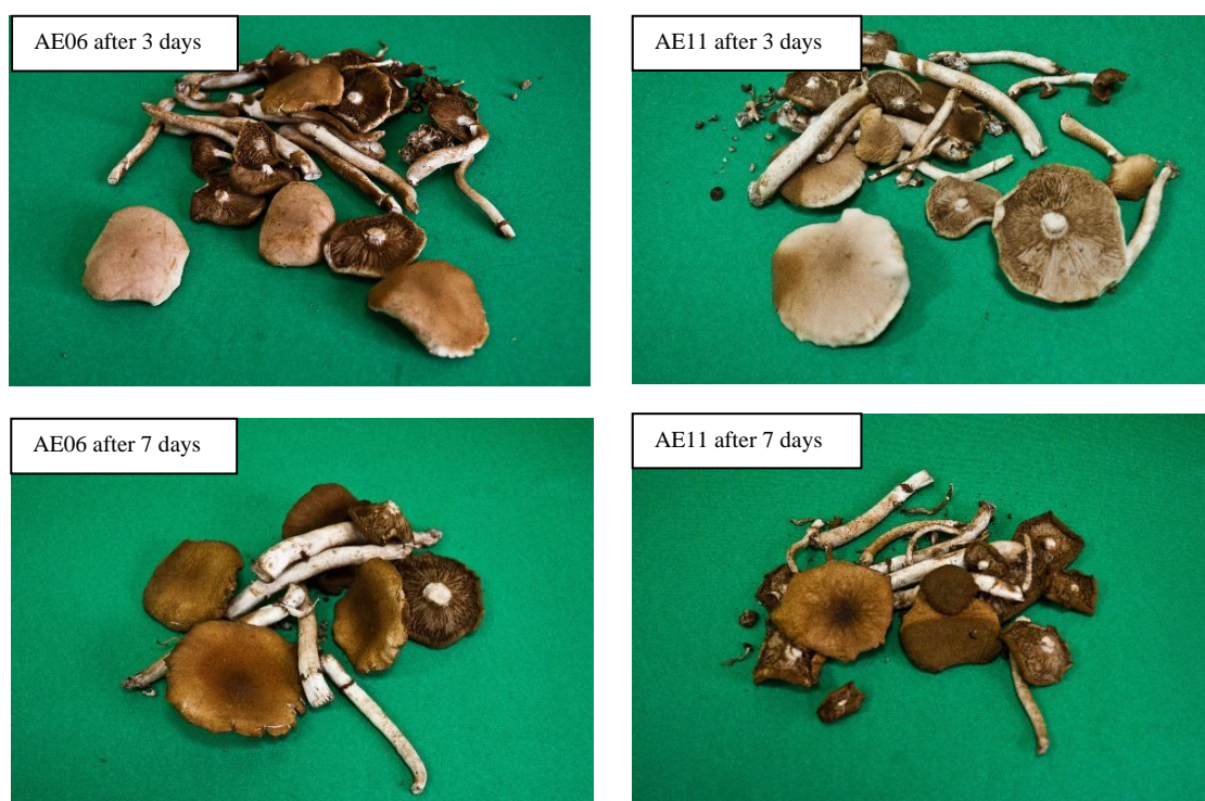
Figure 5. Fruiting bodies of strain AE06 obtained from substrate with addition of 4 g of \text{CaCO}_3 per 100 g DM substrate after 3 and 7 days of storage and fruiting bodies of strain AE11 obtained from substrate with addition of 8 g of \text{CaCO}_3 per 100g DM substrate after 3 and 7 days of storage