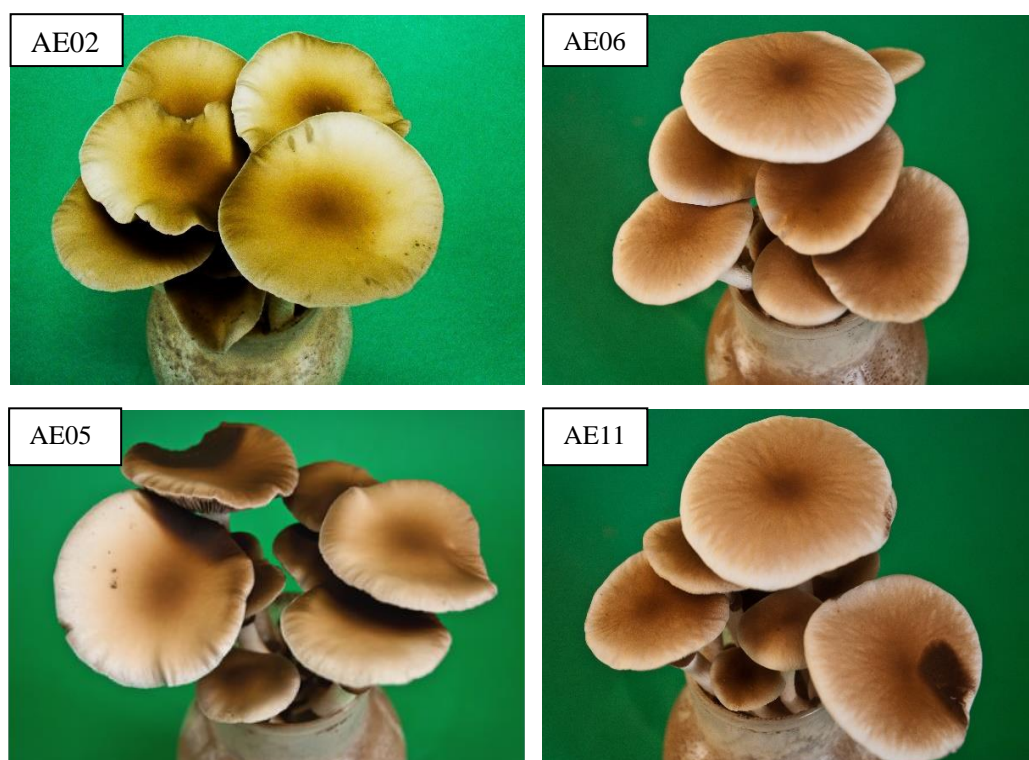
Figure 3. Fruiting bodies of black poplar mushroom obtained from substrate with the addition of CaCO 3 in an amount of 8 g/100g DM substrate

c LSD 0.05 for amounts CaCO 3 = 4.9; LSD 0.05 for strain = 4.9; LSD 0.05 for amount of interaction CaCO 3 x strain = 9.9