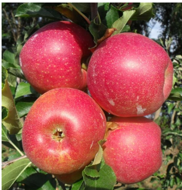
Figure 3. Large orange-red fruits of cv. 'Galiwa'