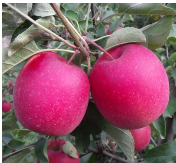
Figure 4. Dark red fruits of cv. 'Story Inored'