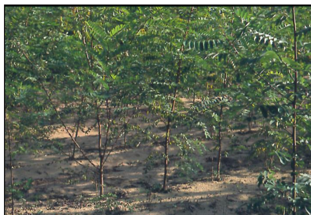
Figure 1. One year old black locust energy plantation

Based on the results of soil preparation experiments the use of costly deep cultivation of 50-70 cm is not justified before establishing of black locust energy plantation. The soil preparation by hard disk and the deep-ploughing of 30-40 cm are sufficient before planting. In the small number of cultivation experiments the most common planting spacing is 1.5 x 0.3-0.5 m ( Figure 1 ). The applicable planting spacing among other things is determined by the production target, growing cycle as well as the applicable machine type. The application of denser planting spacing (smaller interrow spacing) then the recommended one is usually not justified because according to the relevant data of spacing experiments