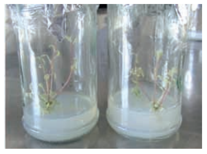
Fig. 3. In vitro elongation of Atriplex halimus L on control medium

Different letters within a column indicate significant differences according to Duncan's multiple range test (P < 0.05). Data are means of 30 replications