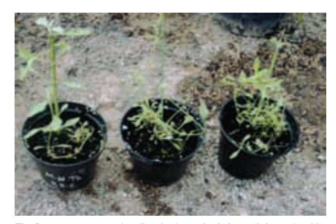
Fig. 5. In vitro propagated acclimatized Atriplex halimus (2-3 months old) grown in the green house

changes in environmental conditions to avoid desiccation losses and photo inhibition (Kozai et al. 1991).Al-Wasel (1998) reported a 55%acclimatization efficiency form icropropagated A. nummularia , which is in agreement with the findings of our study but 65% efficiency for A. halimus in which rooted plantlets were acclimatized to ambient conditions within 2 months and were later established under greenhouse conditions ( Fig. 5 ) and finally in the field under natural conditions ( Fig. 6 ). Mei et al. (1997) also reported 65% survival of acclimatized shoots of A.canescens . Rooted A.canescens plantlets were also successfully acclimatized by Malan (2000) but without any reference to the acclimatization efficiency obtained.