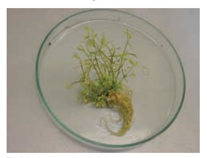
Fig. 4. Rooting in vitro of Atriplex halimus

Shoot tips and axillary buds from 2-year-old shrubs were excised and used for micropropagation because some studies mentioned that shoot age influences rooting positively probably because of the greater quantity of reserve material, or because of bud dormancy (Amato et al. 1990).