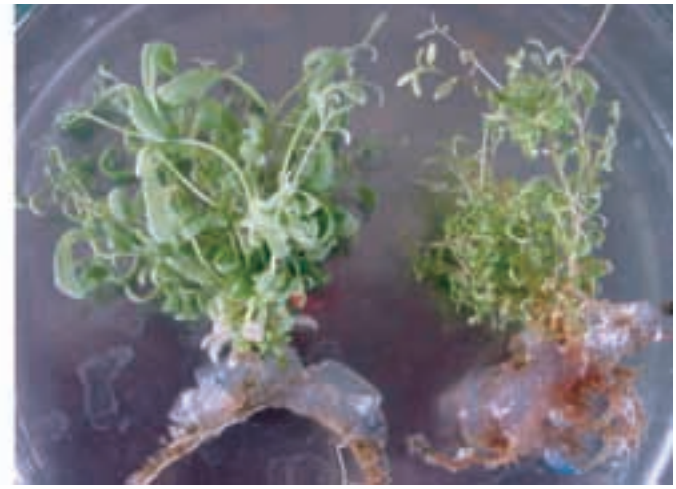
Fig. 7. Effect of NaCl on the growth and size of the leaves in vitro of A. halimus L. Left : shoots grown on medium 5 with 200 mM NaCl. Right : Control: shoots grown on medium free of NaCl

recorded in the present study. Such an assumption agrees with that of Bajji et al. (1998) who studied A. halimus grown in media artificially salinized with NaCl. They reported that the physiological mechanism underlying growth stimulation of Atriplex plants is still unknown and that such a genus undoubtedly constitutes one of more convenient subjects for investigating the halophytic properties in the plant kingdom. Although not proven, an assumption exists where increased activity of protein synthesis leads to improved growth and is considered of great biochemical and physiological relevance within a given range of NaCl depending on the plant species(Araújo et al. 2006). A. nummularia may use the controlled uptake of Na+ balanced by other ions, especially Cl-, into a cell to drive water into the plant against low external water potential (Blumwald et al. 2000). A. halimus adopted two different strategies: it behaved as a salt includer at low salinity and as an excluder at high salinity, and growth stimulated in the range of NaCl from 150 to 300 mM (Bajji et al. 1998) which agrees with our present study in which optimal growth occurred at 200 mM.