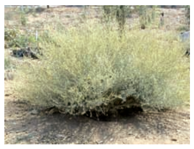
Fig. 6. In vitro propagated Atriplex halimus (1 year old) under field condition