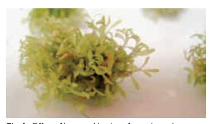
Fig. 2: Effect of best combination of growth regulators on in vitro proliferation of Atriplex halimus L.

Results presented in Table 1 demonstrate the effects of a combination of PGRs at different concentrations on the number and length of shoots. The best multiplication rate was achieved on medium containing 4.44 \mu M BA + 0.49 \mu M IBA + 0.58 \mu M GA<sub>3</sub> with an average of 7.26 new shoots/explant every 4 weeks ( Fig.2 ). On other hand, control medium gave the best average shoot length (2.08 cm) ( Fig.3 ).