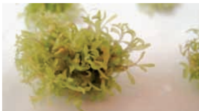
Fig. 2: Effect of best combination of growth regulators on in vitro proliferation of Atriplex halimus L.

Results presented in Table 1 demonstrate the effects of a combination of PGRs at different concentrations on the number and length of shoots. The best multiplication rate was achieved on medium containing 4.44 \mu\text{M} BA + 0.49 \mu\text{M} IBA + 0.58 \mu\text{M} \text{GA}_3 with an average of 7.26 new shoots/explant every 4 weeks ( Fig.2 ). On other hand, control medium gave the best average shoot length (2.08 cm) ( Fig.3 ).