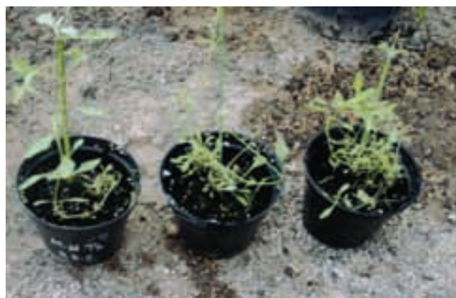
Fig. 5. In vitro propagated acclimatized Atriplex halimus (2-3 months old) grown in the green house

changes in environmental conditions to avoid desiccation losses and photo inhibition (Kozai et al. 1991). Al-Wasel (1998) reported a 55% acclimatization efficiency form micropropagated A. nummularia , which is in agreement with the findings of our study but 65% efficiency for A. halimus in which rooted plantlets were acclimatized to ambient conditions within 2 months and were later established under greenhouse conditions ( Fig. 5 ) and finally in the field under natural conditions ( Fig. 6 ). Mei et al. (1997) also reported 65% survival of acclimatized shoots of A. canescens . Rooted A. canescens plantlets were also successfully acclimatized by Malan (2000) but without any reference to the acclimatization efficiency obtained.