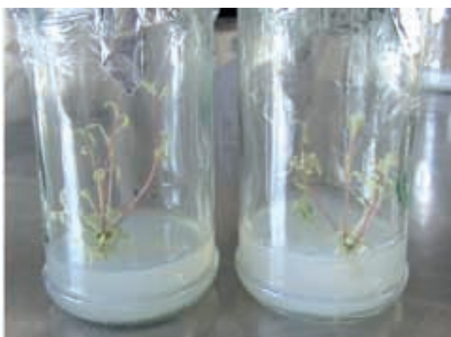
Fig. 3. In vitro elongation of Atriplex halimus L. on control medium

Cytokinins such as TDZ and BAP have considerable effects in inducing regeneration in most woody plants (Korban et al. 1992; De Bondt et al. 1996). BA has been the most commonly used cytokinin for proliferation of