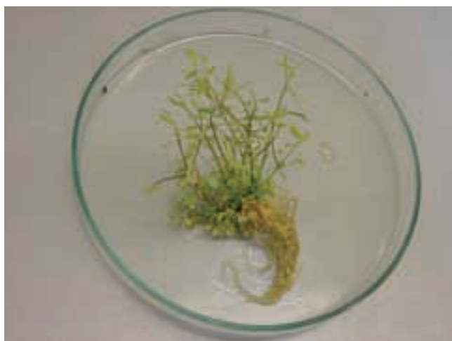
Fig. 4. Rooting in vitro of Atriplex halimus

Shoot tips and axillary buds from 2-year-old shrubs were excised and used for micropropagation because some studies mentioned that shoot age influences rooting positively probably because of the greater quantity of reserve material, or because of bud dormancy (Amato et al. 1990).