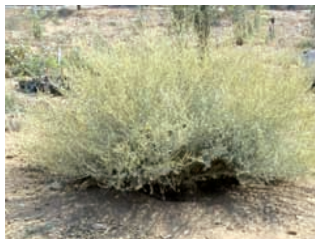
Fig. 6. In vitro propagated Atriplex halimus (1 year old) under field condition