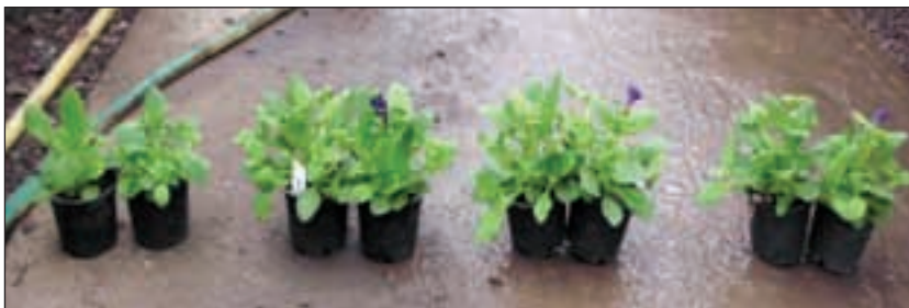
Fig. 2.: Difference among groups at the end of the experiment (from left to right: Control; 0,1% FL; 0,2% FL; 0,3% FL)

Based on the results the use of Ferbanat L gave good progress towards the Petunia x grandiflora 'Musica Blue'. The most appropriate concentration was 0.1%, which gave the best results in the shoot length. Although in the aspect of leaf length and flower bud number the 0.1 % concentration gave weaker results than the control group, but the difference was not significant. In all the treated groups the flower buds appeared five days earlier comparing to the control, therefore earlier flowering occurred, so the growing period shortened (Fig. 2). It has importance in the horticultural practical aspect.