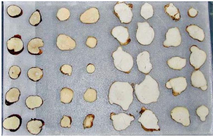
Figure 2. Tuber slice test method. Tuber slices placed on the layer of sterile water-soaked lab paper (Cho et al., 2013).

conditions are similar to those used in the tubers/rhizomes method. The measurement of resistance starts from the second day up to the sixth day. It consists of measuring the weight before and after washing away the infected tissues (Snijder & Van Tuyl, 2002).