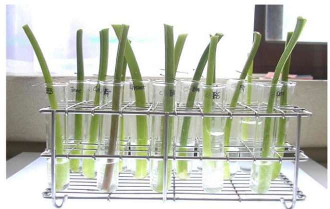
Figure 4. Petiole test.

(Cho et al., 2013; Snijder & Van Tuyl, 2002). Currently, there is no agreed classification of calla lily cultivars based on their level of resistance to soft rot. Using leaf disk maceration percentage, Cho et al. (2013, 2014) proposed that calla lily cultivars can be classified as follows: cultivars with 1-10% leaf disk maceration are resistant, 11-30% are moderately resistant; 31-90% are susceptible while 91-100% are very susceptible. Joung et al. (2013) proposed the use of a disease index where 0 is assigned to those cultivars whose disks are not macerated, 1 is assigned to those cultivars whose disks developed symptoms on less than 25 \text{mm}^2 , 2 to those that develop symptoms on 25-50 \text{mm}^2 , 3 to those that develop symptoms on 51-150 \text{mm}^2 , 4 to those that develop symptoms on 151-250 \text{mm}^2 and 5 to those that develop symptoms over 250 \text{mm}^2 . For the classification, Joung et al. (2013) proposed that cultivars with an average disease index of 0-2 are classified as resistant, 2.0-3.5 be classified as moderately resistant and those of 3.5-5 be classified as susceptible.