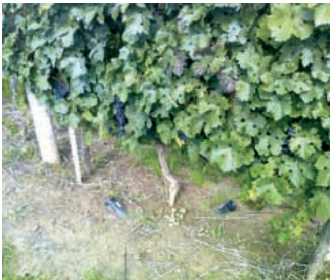
Figure 1: Installation of observation tubes in the vineyard in Cserszegtomaj

Our data show that differences in vineyard development could happen because of not appropriate rootstock choice to climatic and soil conditions. To have well developed, highly productive plantation (Figure 4) careful scion-rootstock combination needs to be choose.