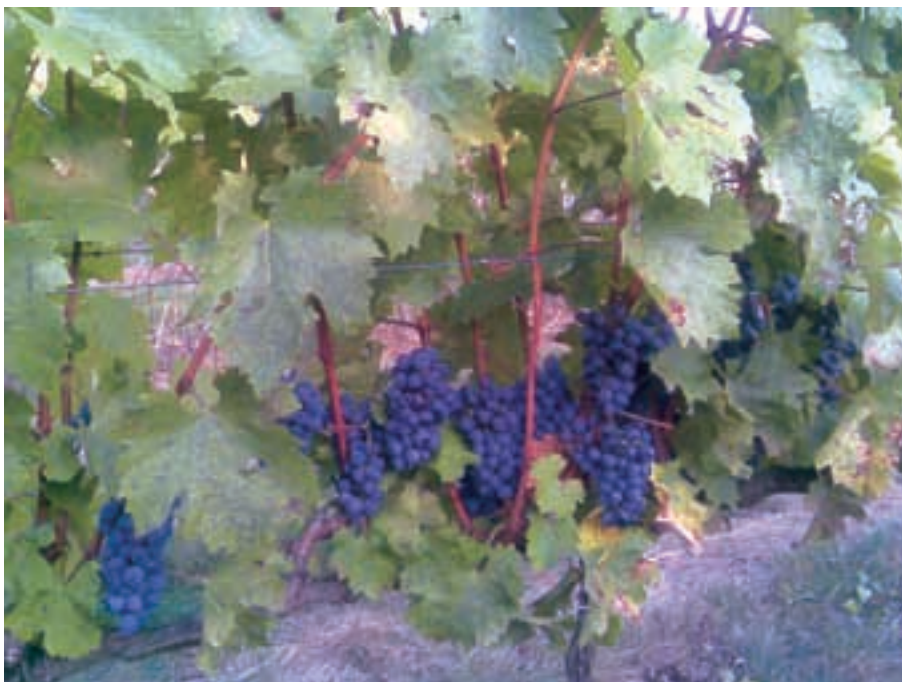
Figure 4: Cabernet sauvignon vinestock in Cserszegtomaj, Hungary