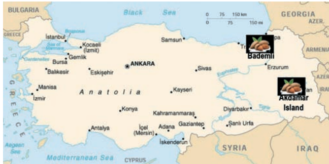
Figure 1. Map of Turkey, the origin of Turkish almond accessions (Bademli and Akdamar Island) are signed with small almond symbols

sampled trees growing wild on the Akdamar Island and 31 trees occurring around the village Bademli ( Figure 1 ). The local Hungarian cultivars were obtained from the orchard of the Corvinus University of Budapest, Department of Genetics and Plant Breeding in Szigetcsép, Hungary.