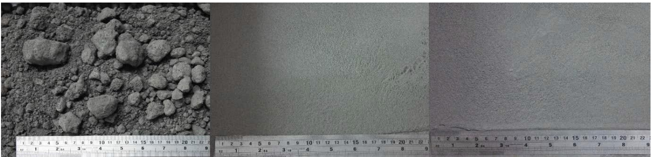
Figure 3. Images of raw (left), and sieved < 600 \mu\text{m} (centre) and < 63 \mu\text{m} (right) fly ash samples [36]

Screening is the simplest approach for fly-ash processing which can enhance reactivity by separating the coarse particles and foreign matters. The effect of screening can be observed in Figure 3. For dry screening, 45 and 63 \mu\text{m} sieves are the most commonly used, and still economical sieve sizes [5, 35]. Air classification provides particle separation size and density and may be performed for the removal of coarse particles or for the selective concentration of finer particle size. Via particle size control methods, the unburned carbon content of the fly ash can be decreased, too, the high quantity of which may also hinder fly ash utilisation. Other methods for unburned coal separation can be gravity and electrostatic separation, froth flotation and oil agglomeration [5, 35, 36, 37].