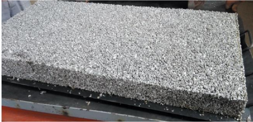
Figure 2. A geopolymer-eps composite specimen [21]

Other possible applications of fly ash include the production of fly ash foam glass as insulation material [22, 23], porous catalysts [4], hydraulic road binders [24] or proppant for oil and gas wells [25].