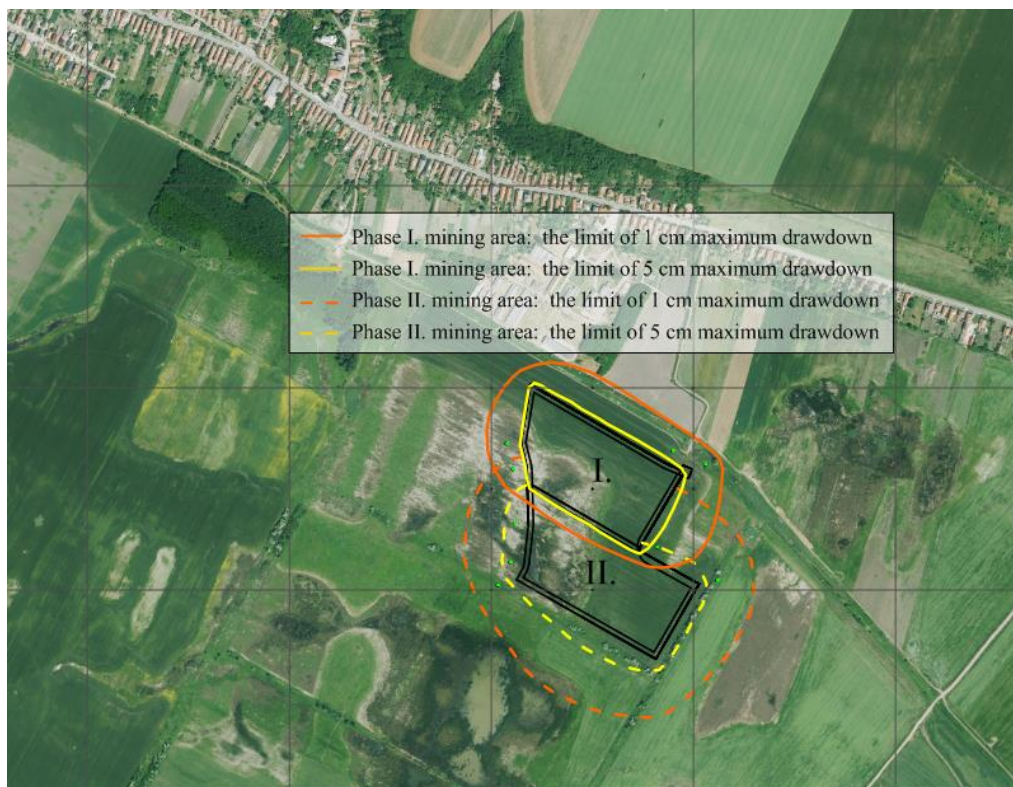
Figure 2. The dewatering influenced zone

Due to the clayey barrier the risk of inrush is minimized and the effect of the dewatering to the groundwater levels is negligible: the maximum drawdown area is 160 m from the boundary of the pit (Figure 2.)