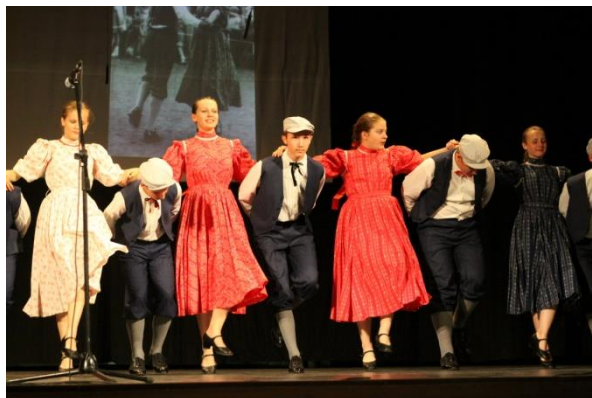
Figure 9. Elementary Art School of Folk Dance and Music in Ružomberok

One of the outputs for monitoring the level of the school and individual students are concerts held twice a year, where students perform for the general public. It is a 90-minute programme in cooperation with the Liptov Folklore Ensemble presenting the folk customs, games, songs and dances in the folk costumes, usually of one village from Lower Liptov.