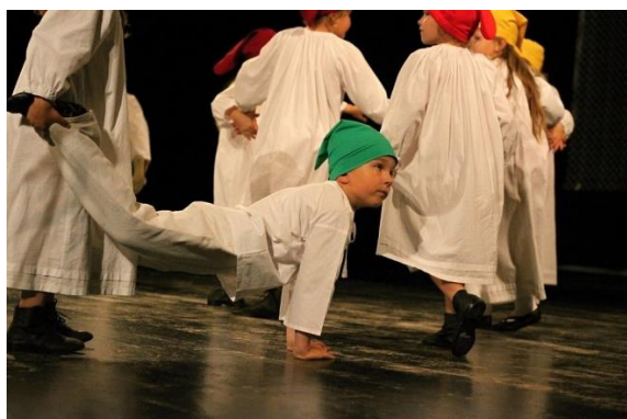
Figure 5., 6. Elementary Art School of Folk Dance and Music in Ružomberok

Out of the elementary art schools in Liptov and Orava, only two schools responded. We assume that the low return of questionnaires from the artistic environment is a manifestation of peripheral education in folk art in this system of schools, the emphasis is on classical art. One of the schools that responded was the Elementary Art School of Folk Dance and Music in Ružomberok .